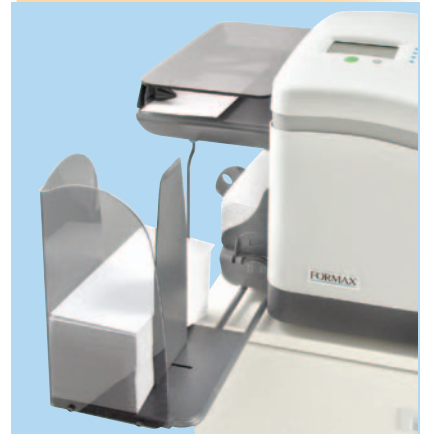
Side Exit Tray