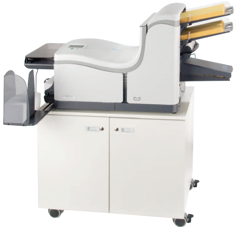
Shown with optional Side Exit Tray and Cabinet