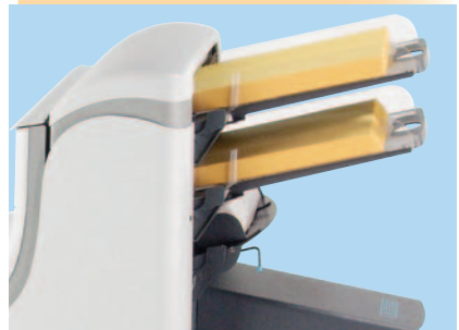
2 sheet feeders and 1 insert/BRE feeder